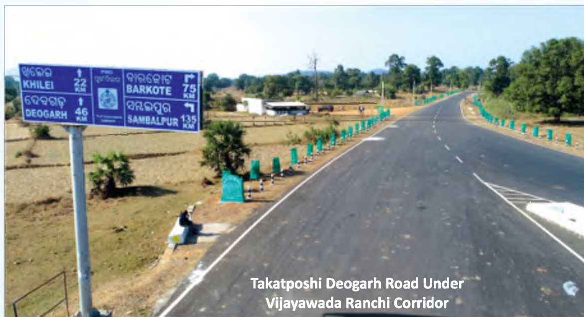
Takatposhi Deogarh Road Under Vijayawada Ranchi Corridor

It is targeted to complete the entire length of 962.71Km of V.R. Corridor in Odisha by 2019.