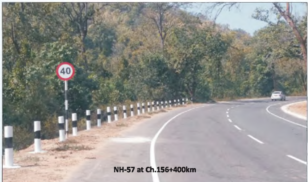
NH-57 at Ch.156+400km