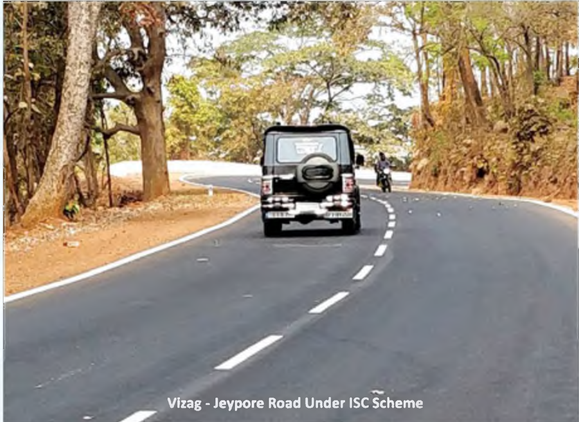
Vizag - Jeypore Road Under ISC Scheme

Government of India have sanctioned 9 nos. of Road Projects under this scheme with an estimated cost of Rs.164.65 Crore with 100% Central Share till March, 2015. Out of 9 projects, 7 projects have been completed with an expenditure of Rs.57.94 Crore with improvement of 113.390km against the Central Assistance received of Rs.55.35 Crore by the end of March,2015.