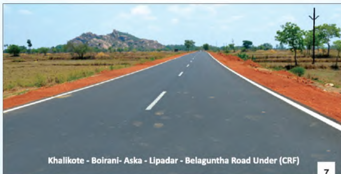
Khalikote - Boirani- Aska - Lipadar - Belaguntha Road Under (CRF)