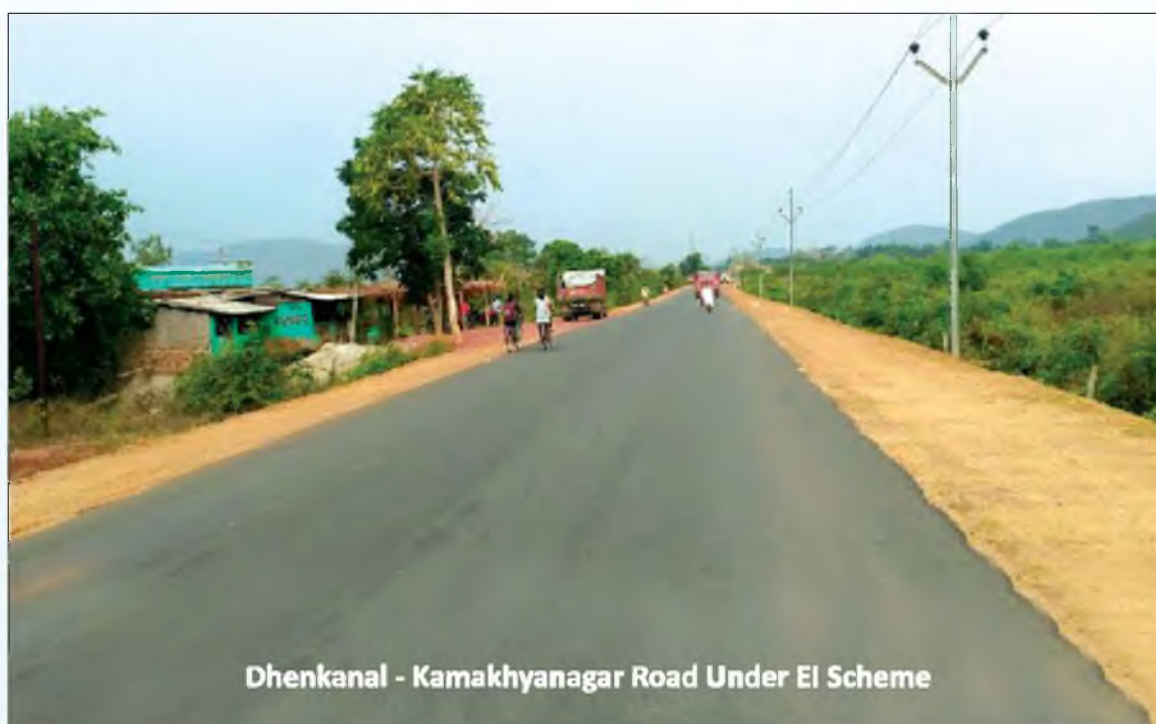
Dhenkanal - Kamakhyanagar Road Under EI Scheme

During 2017-18, Project proposals for 2 nos. of road projects covering a length 44.77Km with a cost of Rs.132.82 Crore have been submitted to MORT&H, Government of India for sanction.