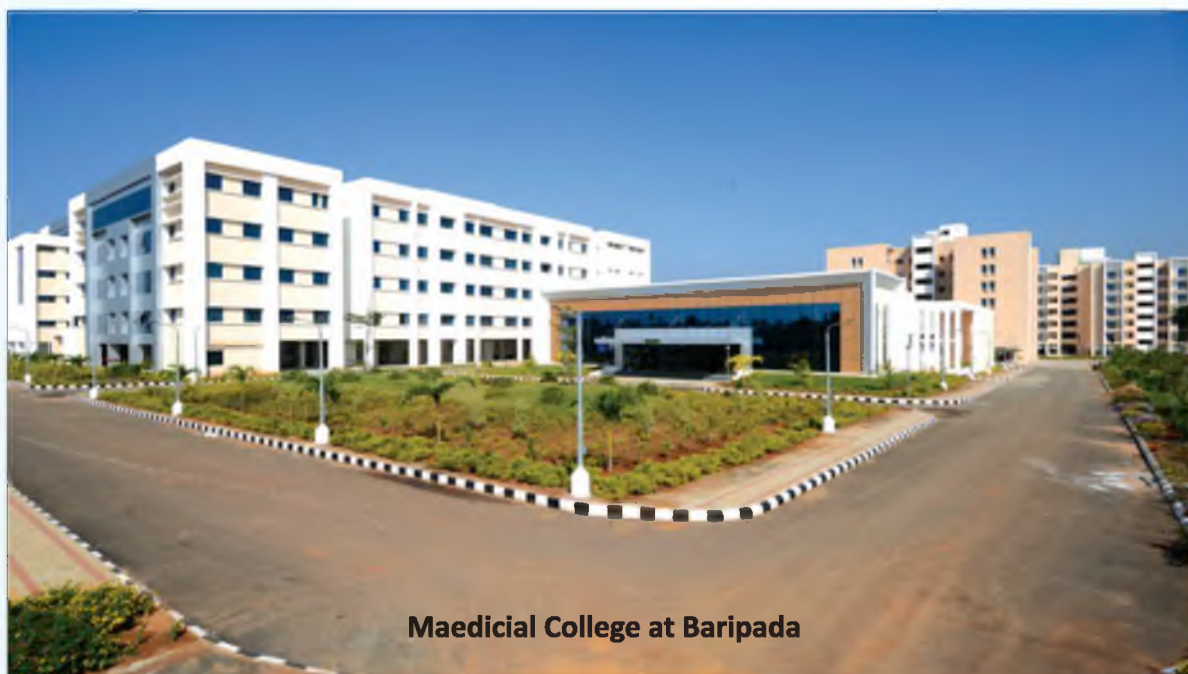
Maedicial College at Baripada