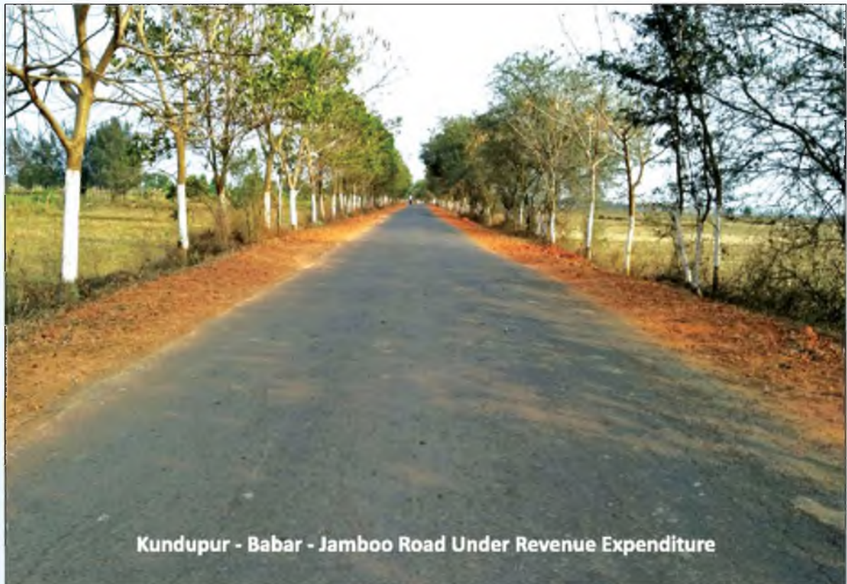
Kundupur - Babar - Jamboo Road Under Revenue Expenditure