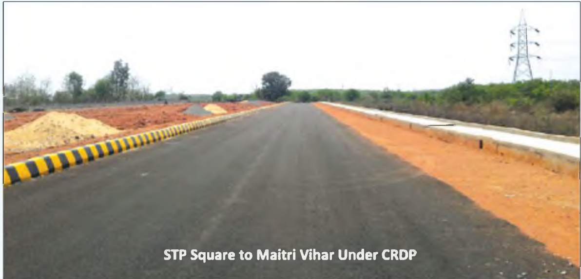
STP Square to Maitri Vihar Under CRDP

During 2017-18, there is a Budget provision of Rs.40.00Crore under this scheme. By the end of December, 2017, during 2017-18, action has been taken for improvement of further length of 23.12Km of road length with a cost of 101.33Crore. By the end of December, 2017, during 2017-18, 5.33Km of road length has been improved with an expenditure of Rs.10.16Crore. During 2018-19, there is a budget proposal of Rs.50.00Crore under the scheme for completion of ongoing projects & to take up development of new roads in Capital City.