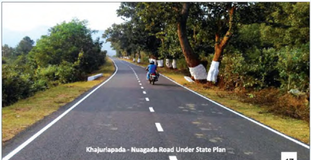
Khajurhapada - Nuagada Road Under State Plan

During 2016-17, 26 Nos. Bridges, 1No. ROB, 03 Nos. of Minor Bridges & improvement of 270.90Km of road length was completed under State Plan (Normal) with an expenditure of Rs.740.21Crore.